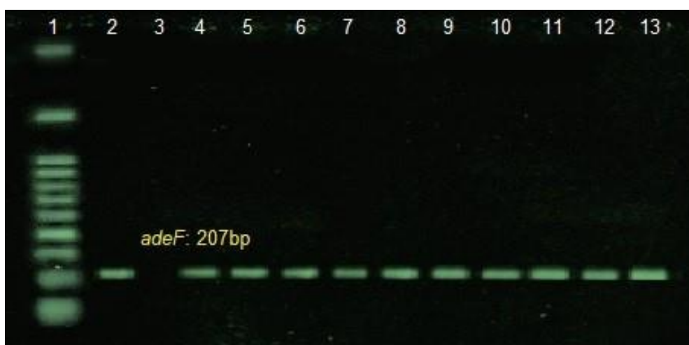
Fig. 1. PCR amplification of the AdeF gene. Lane 1: Ladder (100 bp), lane 2: positive control (207bp); lane 3: negative control, lane 4- 12, and 13: positive results.