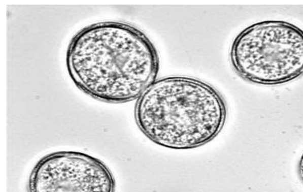
Fig. 2. Light microscopy image of Platanus orientalis grains (X100).

The pollen grains extracts containing excipients were evaluated by the normal stability test. Before the test each mixture was incubated at room temperature (24 ± 2 °C) for 24 h to complete the emulsification process (29).