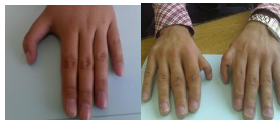
Fig. 1. Hands of patients with Holt-Oram or heart-hand syndrome. Both thumbs are abnormally short and curved.