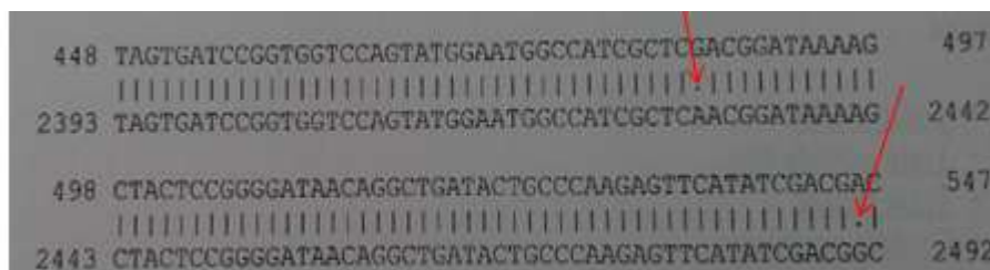
Fig. 2. Schematic representation of a mutation in 23S rRNA genes in online clustalW2 software. The image of both mutations is shown in positions 2431 and 2491.