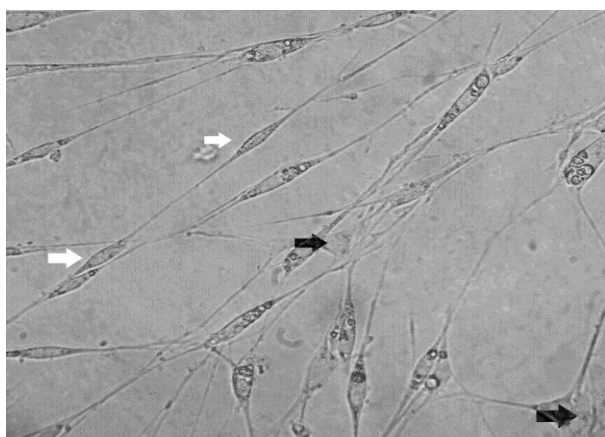
Fig. 2. Two types of cells are present: Fibroblasts (black arrow) with flat polymorphic forms, larger nuclei, and larger cytoplasm. Schwann cells (white arrow) had bipolar or tripolar spindle shapes and smaller sizes (20 \times ).

After 48 hours of primary cell culture, Schwann cell purification was performed by changing the concentration of FBS. In the first group, the numbers of fibroblasts increased after 72 and proliferated more quickly than Schwann cells. In groups 2 and 3, the concentration of FBS was reduced, and on days 5 and 6, the number of fibroblasts significantly changed (Fig. 2). The purity of Schwann cells at FBS concentrations of group 1 (10%), group 2 (5%), and group 3 (2%) were 93.42%, 91.25%, and 97.83%, respectively.