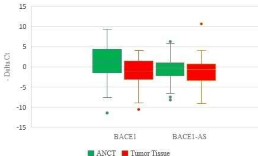
Fig. 1. Relative BACE1 and BACE1-AS expression in tumoral tissues and ANCTs.