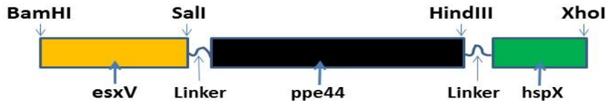
Fig. 1. Schematic illustration of synthetic construct. The AEAAAKEAAKA linker and different enzyme cutting sites were placed between the selected genes.